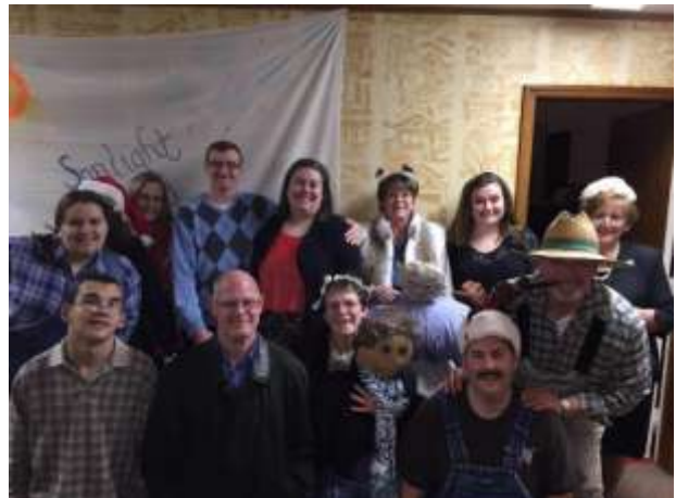
The Cricket County Crew