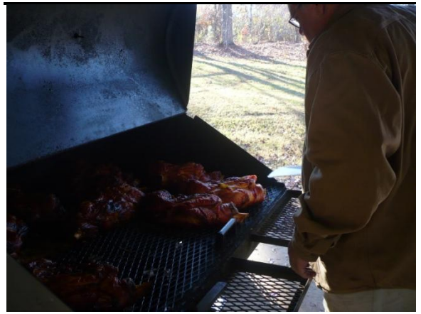
United Methodist Men Pork Shoulders